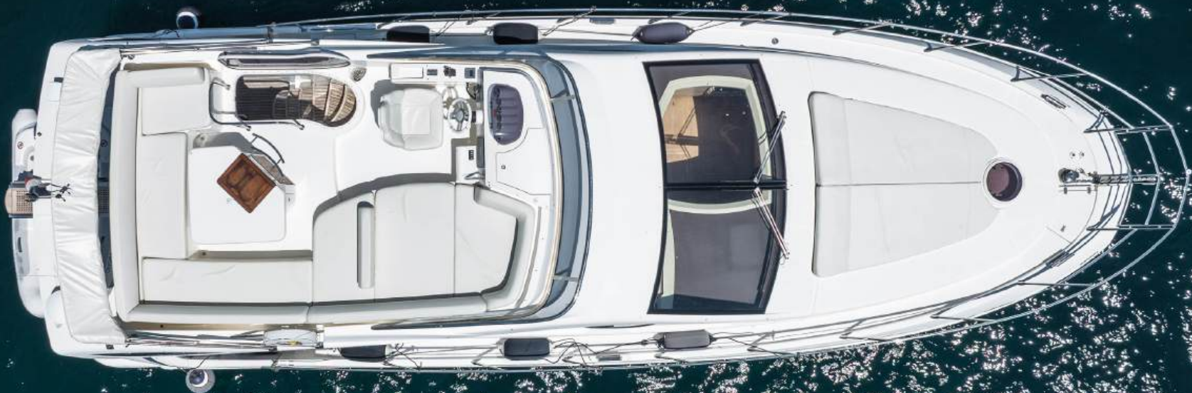
M/Y OXYGENE HI