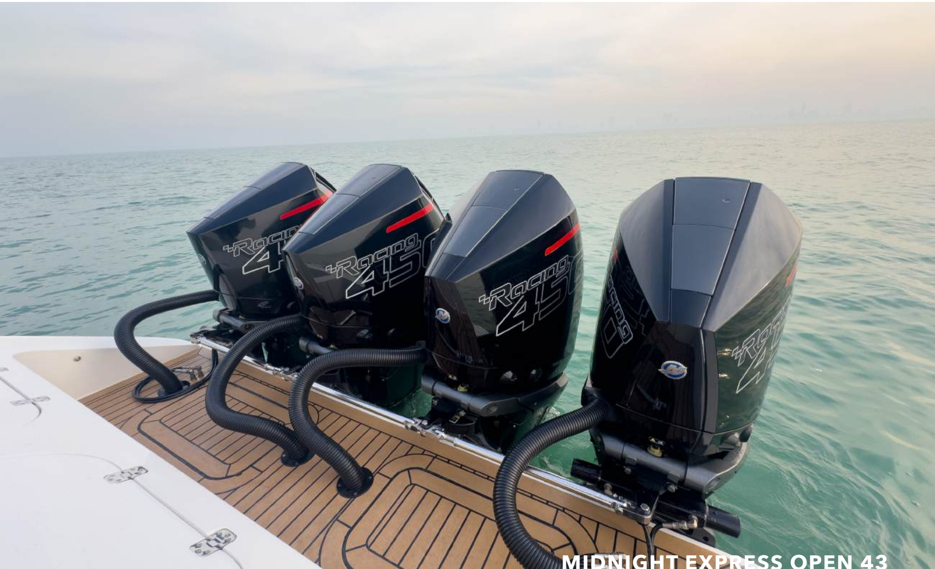
MIDNIGHT EXPRESS OPEN 43