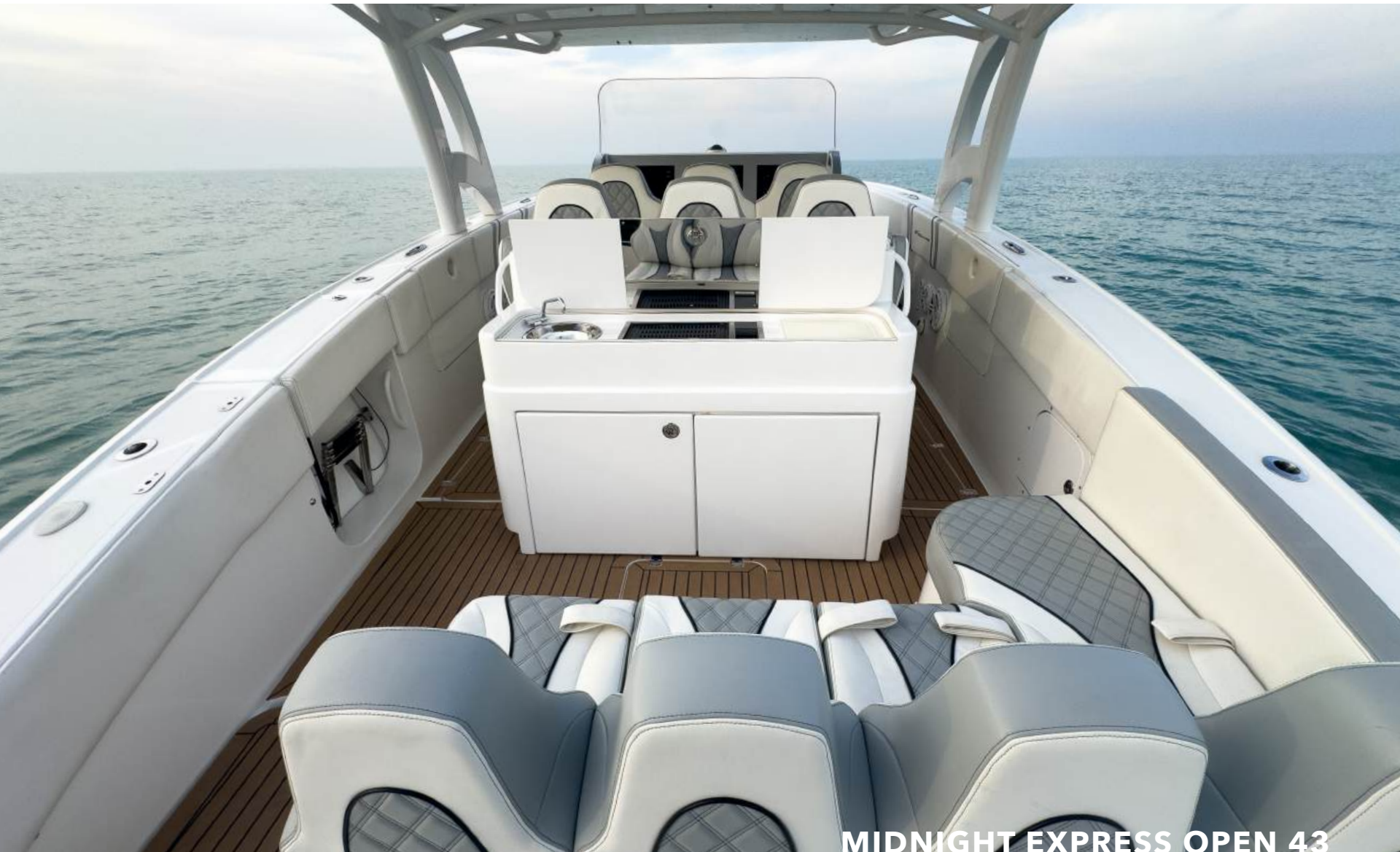
MIDNIGHT EXPRESS OPEN 43