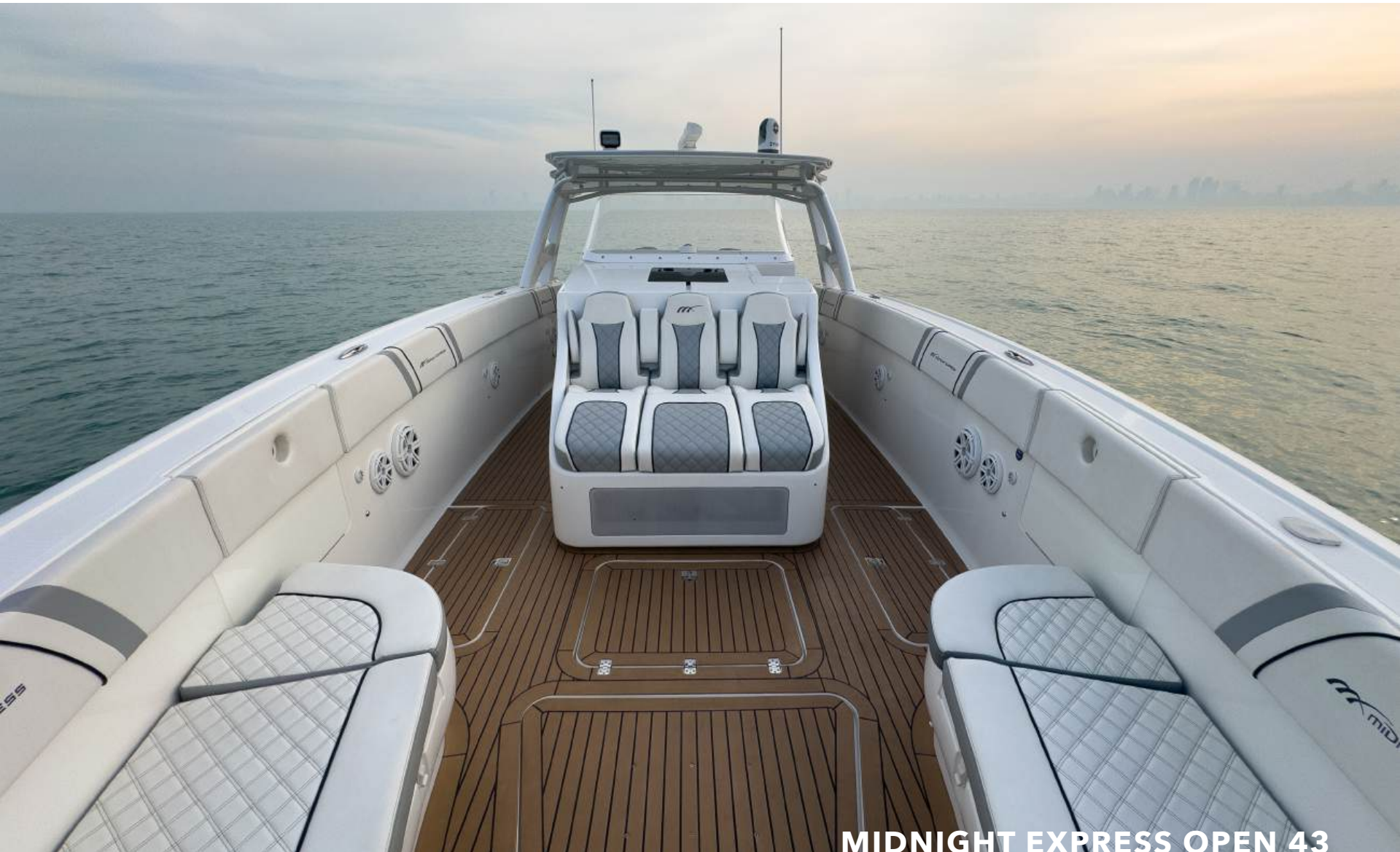
MIDNIGHT EXPRESS OPEN 43