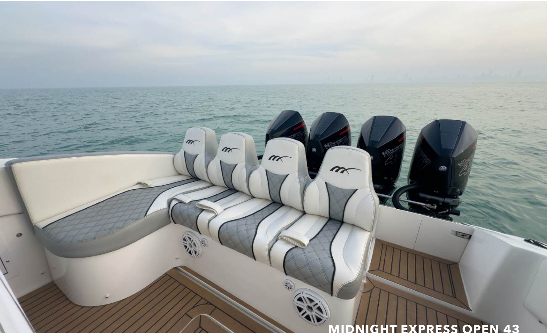
MIDNIGHT EXPRESS OPEN 43