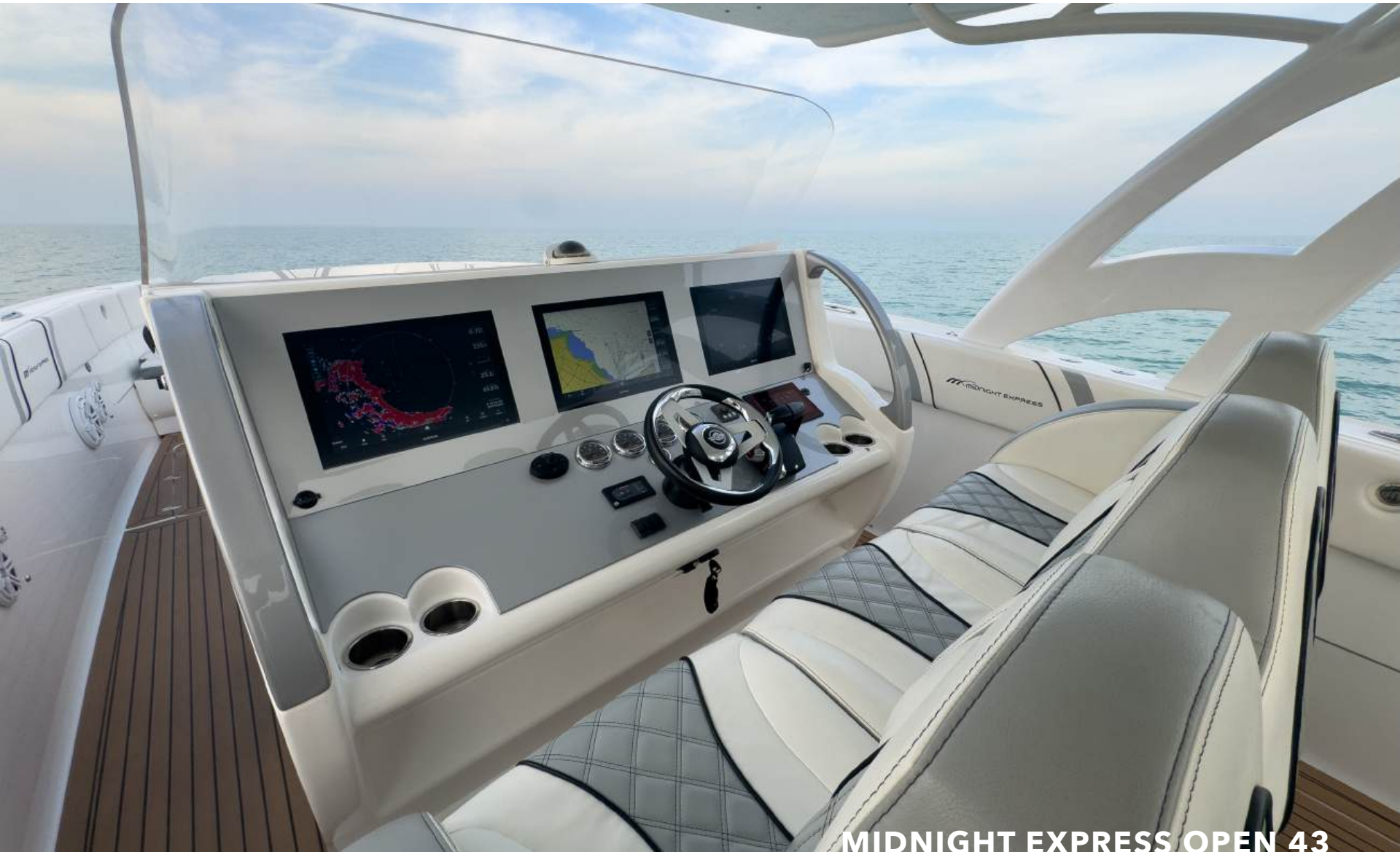
MIDNIGHT EXPRESS OPEN 43