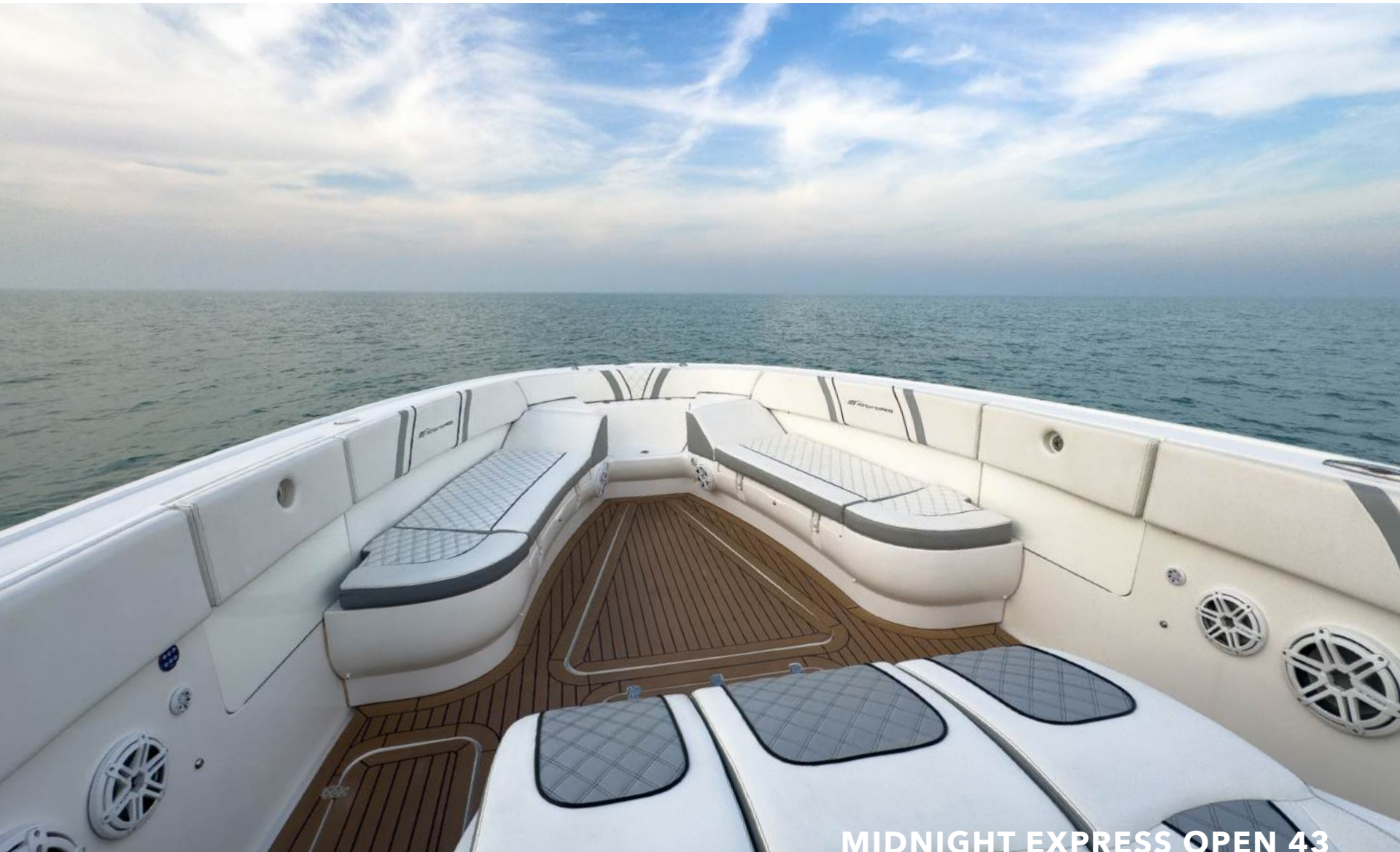
MIDNIGHT EXPRESS OPEN 43