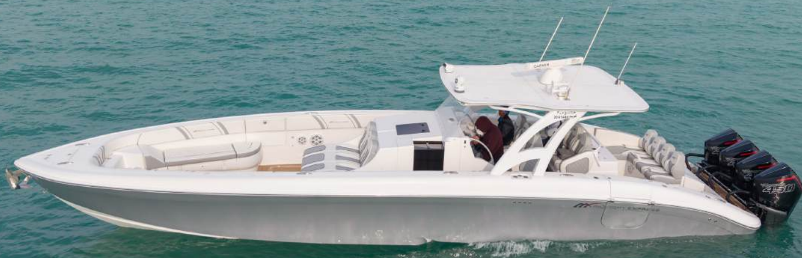
MIDNIGHT EXPRESS OPEN 43