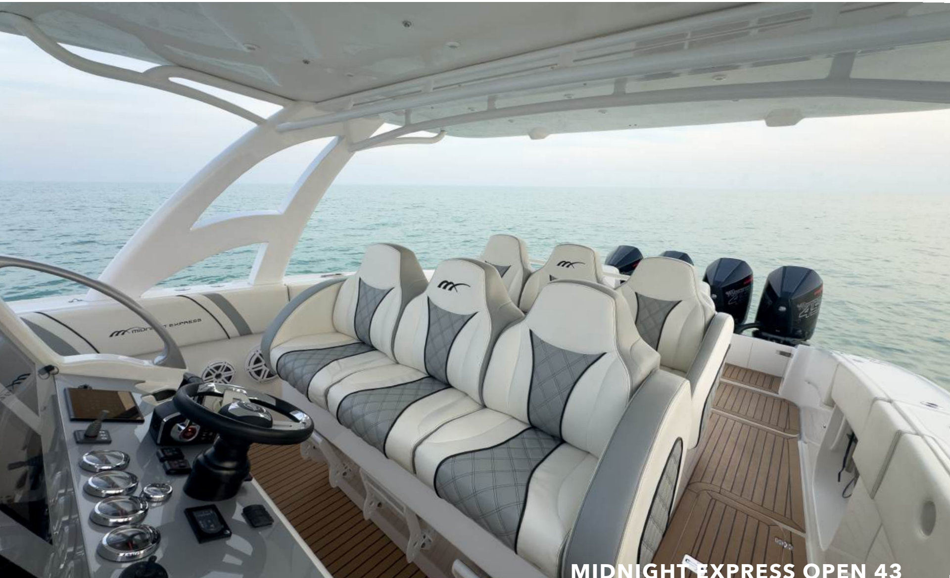
MIDNIGHT EXPRESS OPEN 43