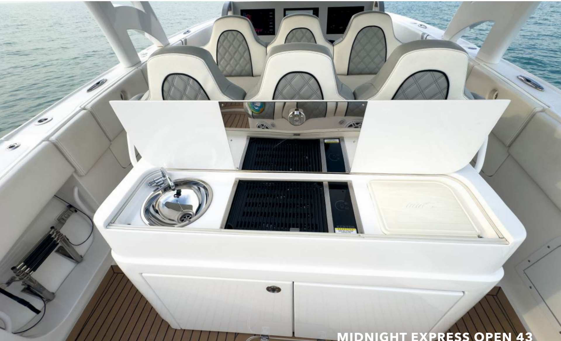
MIDNIGHT EXPRESS OPEN 43