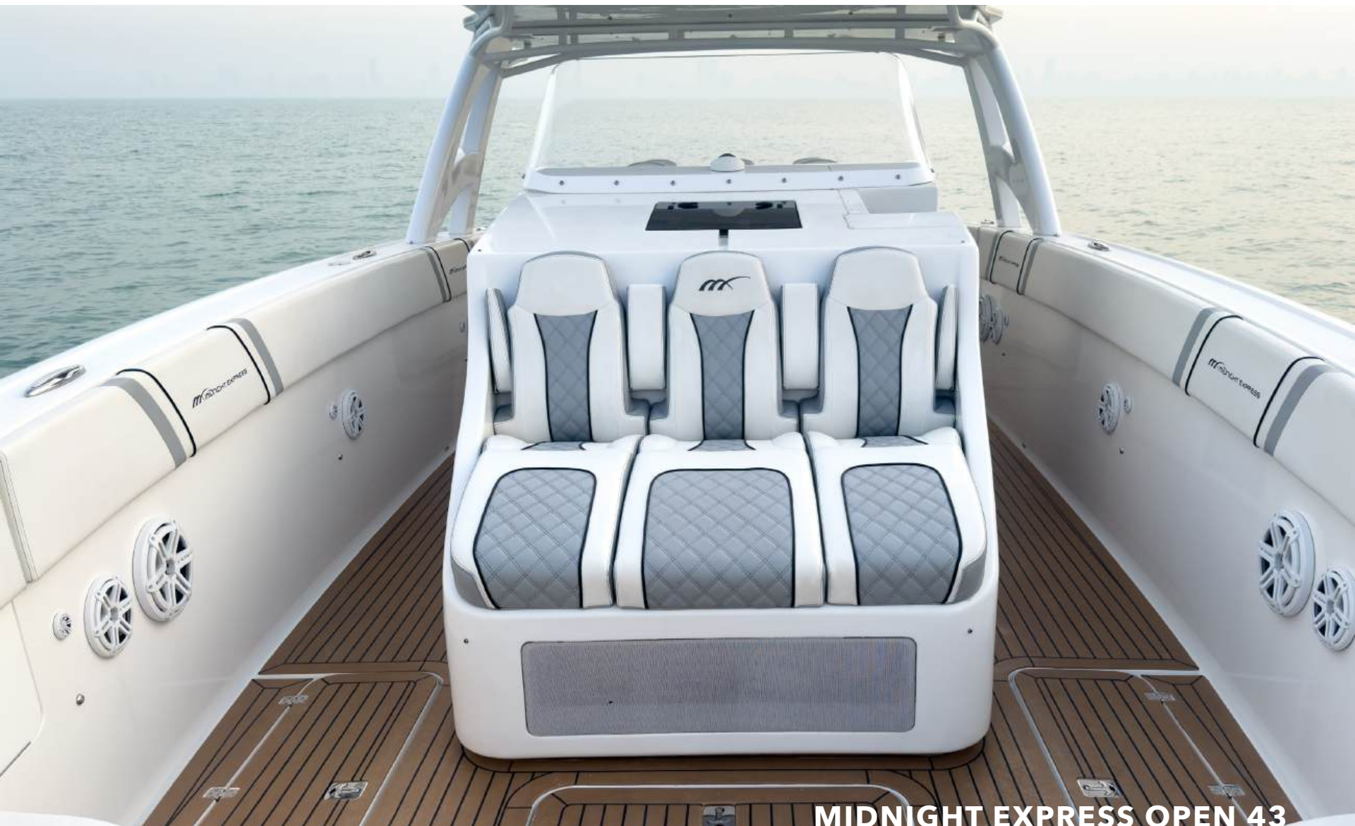
MIDNIGHT EXPRESS OPEN 43